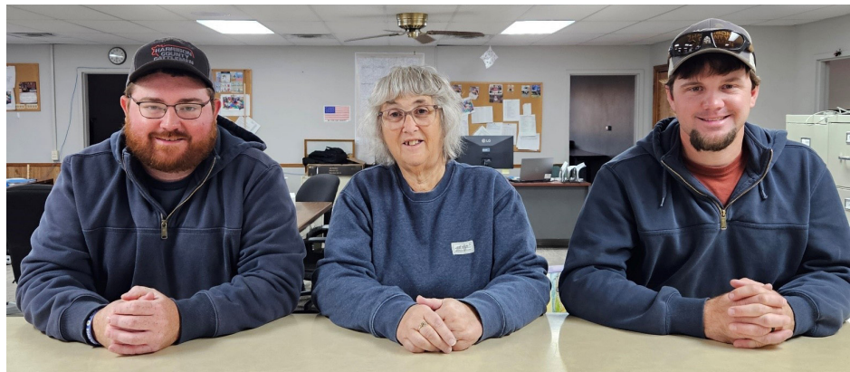
Harrison County Staff

The district frequently measures drainage areas for road tubes for the county road and bridge crews.