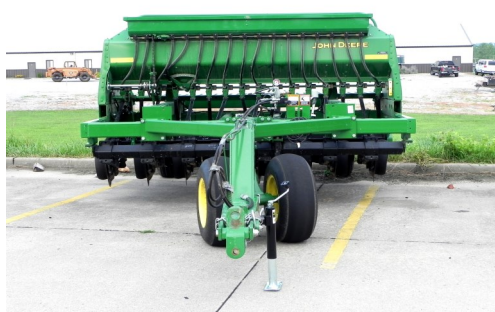
10' John Deere—$9/AC—10 AC minimum