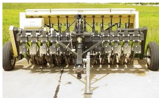
8' Truax Drill —$10/AC