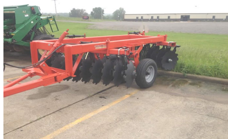
Offset Disk —$30/day or $75 /weekend