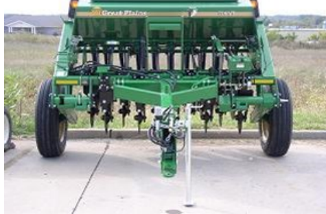
7' Great Plains Drill—$8/AC * 10 AC minimum