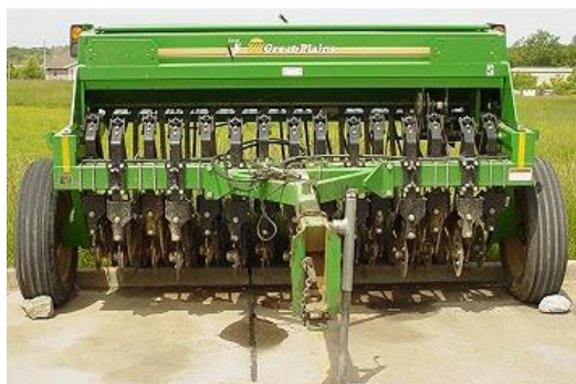
10' Great Plains Drill—$9/AC—10 AC minimum Requires a 80 HP tractor