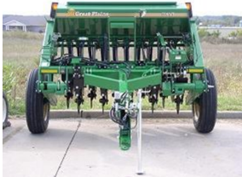
7' Great Plains Drill—$8/AC * 10 AC minimum Requires a 60 HP tractor