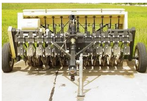
8' Truax Drill —$10/AC Requires a 60 HP tractor