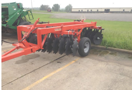
Offset Disk —$30/day or $75 /weekend Requires a 60 HP tractor

If you would like to schedule drills or the disk, please call the office at (573)243-1467, ext. 3.