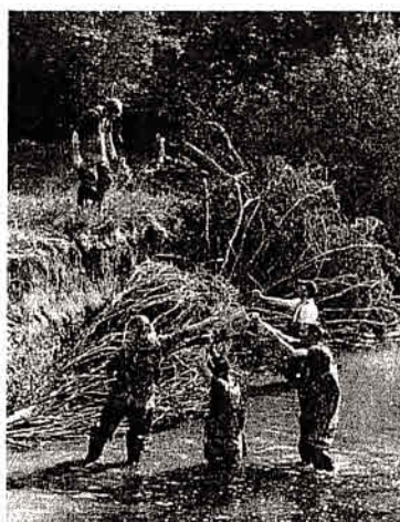
MDC Staff installing the cedar trees on Gabriel Creek.