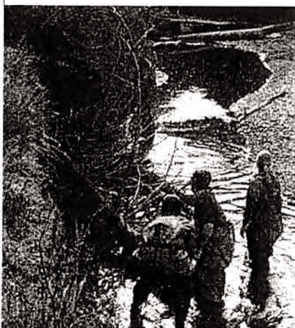
MDC Staff installing the cedar trees on Gabriel Creek.

We would like to thank the citizens of the Gabriel Creek watershed for their interest and participation in this project. We look forward to continuing to assist you and all of the citizens of Morgan County on your water quality and agricultural needs!