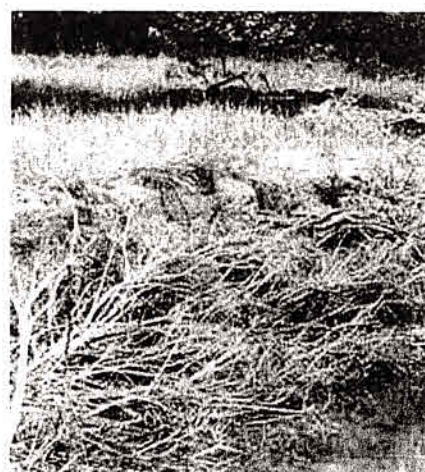
The final product!