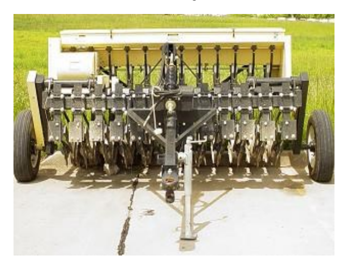
8' Truax Drill —$10/AC Requires a 60 HP tractor