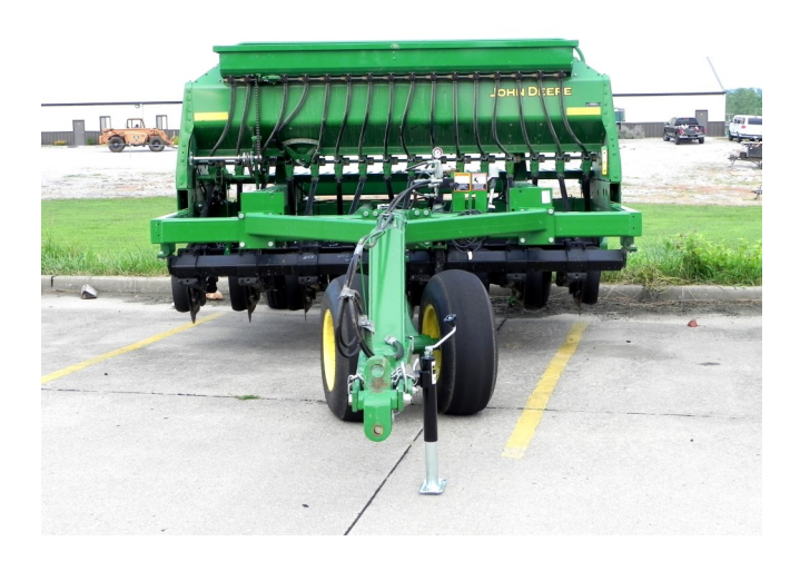
10' John Deere—$9/AC * 10 AC minimum Requires a 80 HP tractor