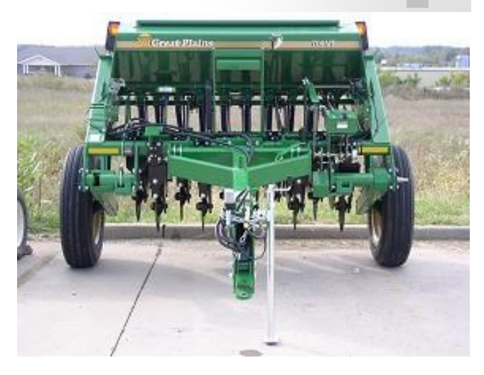
7' Great Plains Drill—$8/AC * 10 AC minimum Requires a 60 HP tractor

Offset Disk —$30/day or $75 /weekend Requires a 60 HP tractor