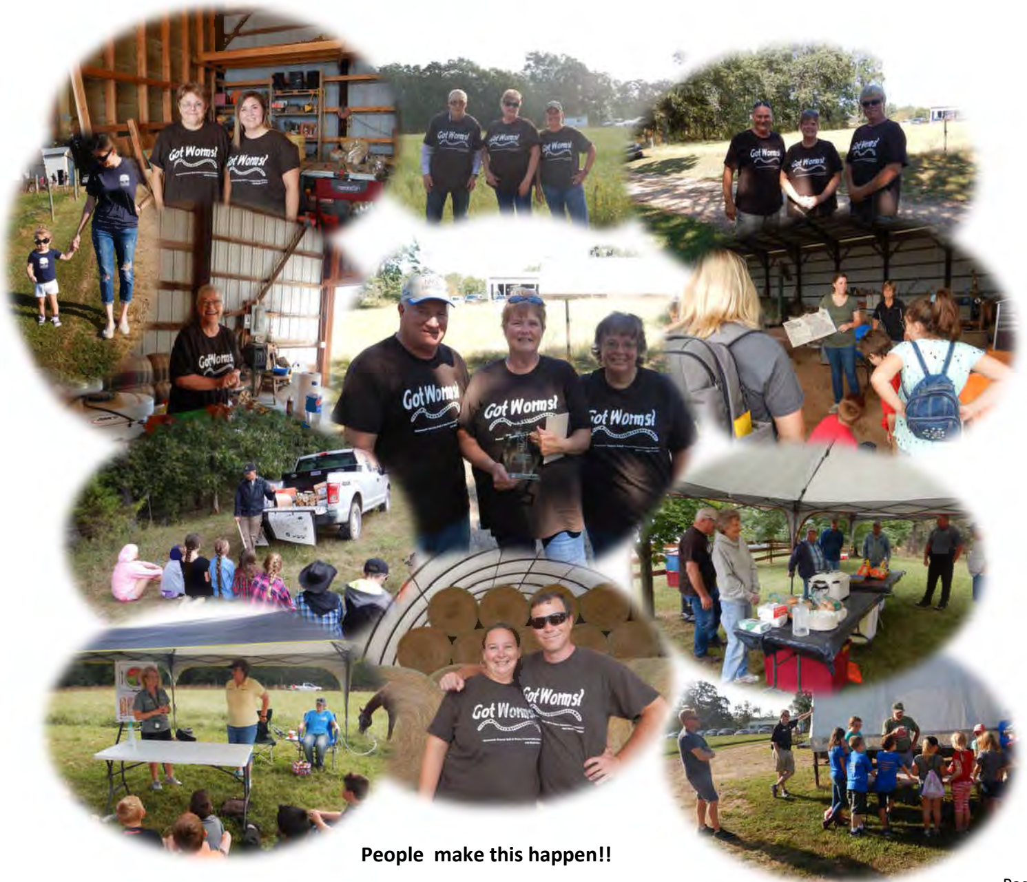
People make this happen!!

The GCSWCD Board is going to strive to continue the 4th Grade Field Days, as it is a great learning experience for the children and their adult sponsors. We look forward to the upcoming year as the White Mule Winery Farm has offered to host our 2020 event.