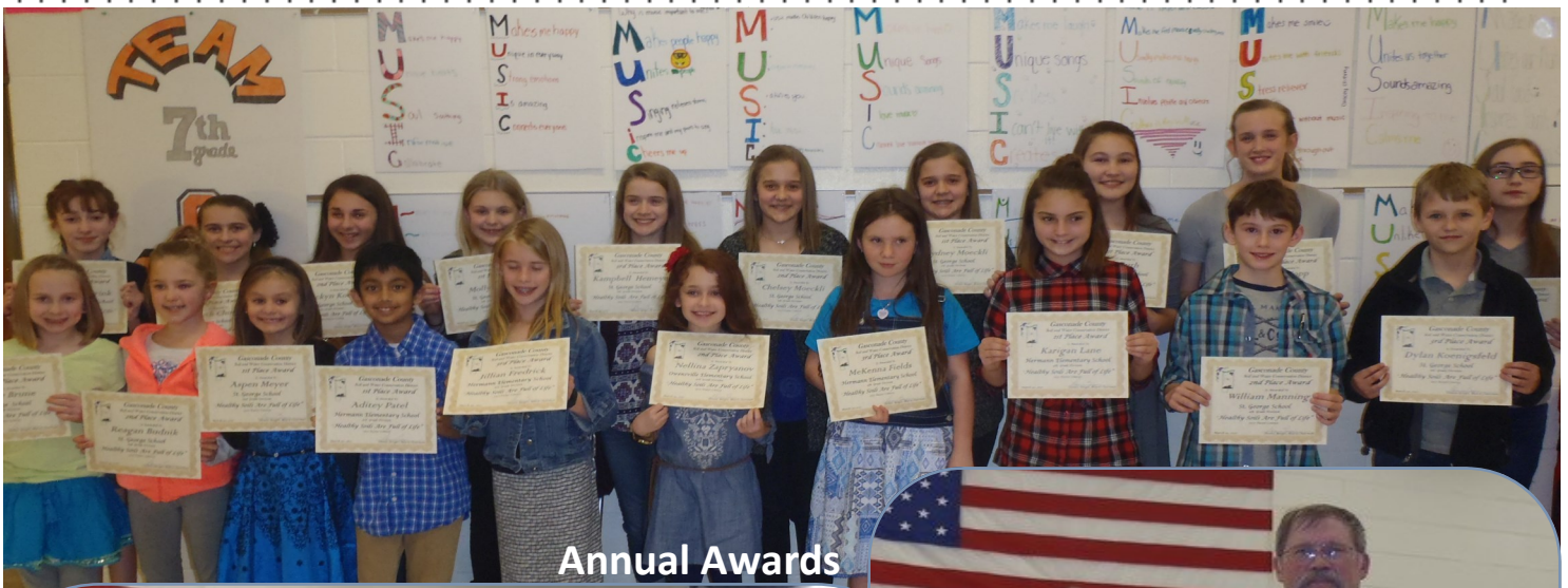
Annual Awards March 30, 2017

N-340, Cover Crop – Provides operators an incentive to encourage the adoption of cover crops for reducing soil erosion, improving water quality and soil health. Applies to cropland acres where row crops are grown and soil erosion needs to be prevented or water quality and soil health improved. Acres must currently be in a production crop rotation. Cover crops must be no-tilled or broadcast seeded within the set time frame. The Production crop following the cover crops must be planted using a no-till system. The cover crop seedings must be planned with a minimum of 25% cool-season annual grass, small grain component or warm season grass. Payment of $30 per acre for a 1 – 2 species planting or $40 per acre for 3 or more species. There is a lifetime maximum of $20,000 per operator.