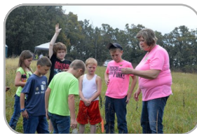
Grassland Site, 4th Grade Field Days