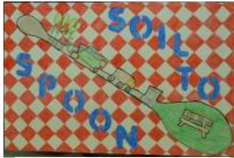
4 th Grade 2 nd Place Kayli Crawford