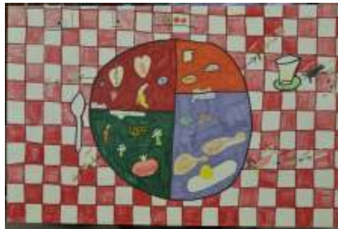
5 th Grade 2 nd Place Emma Baxter