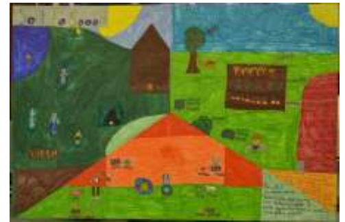
5 th Grade 3 rd Place Taylor Brunelle