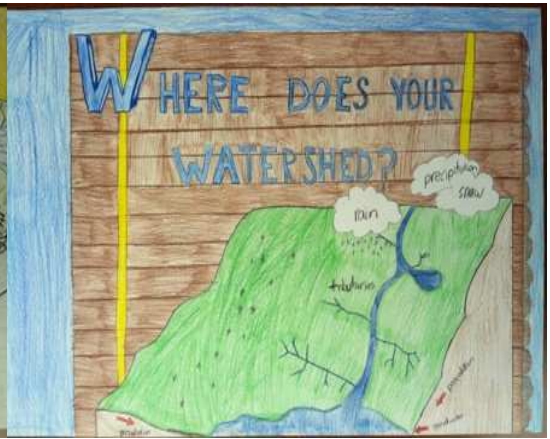
4 th Grade – 3 rd Place Payden McCullough