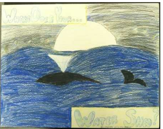
6 th Grade – 3 rd Place River Reiter