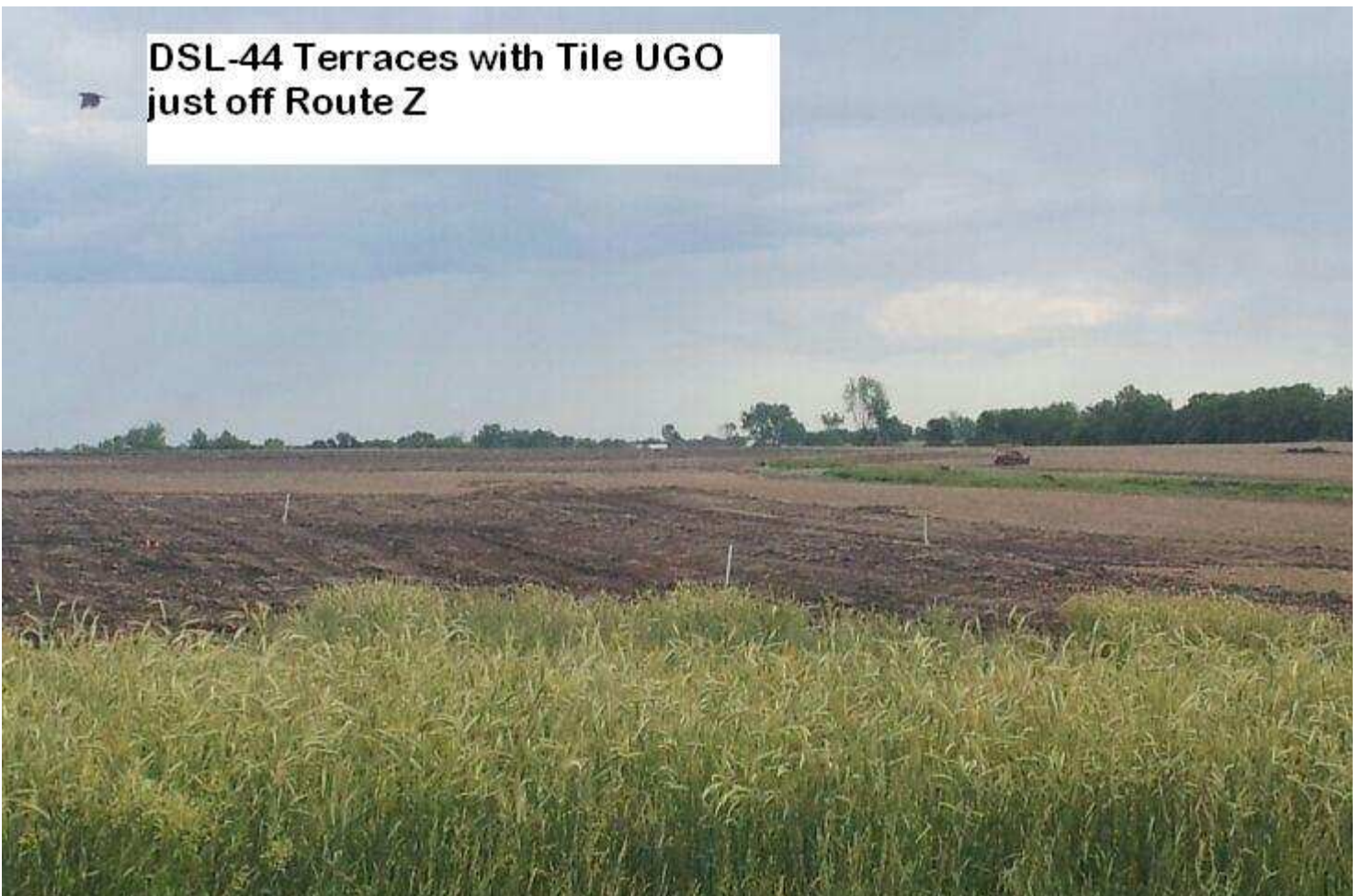
DSL-44 Terraces with Tile UGO just off Route Z

To show some of this completed work, take a look at the photos from just a few of the finished constructed practices that have been completed this past year. As always, the sign up for cost-share is perpetual and you may download an application from our website http://www.swcd.mo.gov/grundy/index.html , drop by our office at 3415 Oklahoma Avenue, or give the District Staff a call at 660-359-2006 Ext. 3.