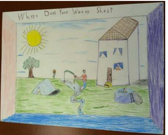
5 th Grade – 3 rd Place Drew Prindle