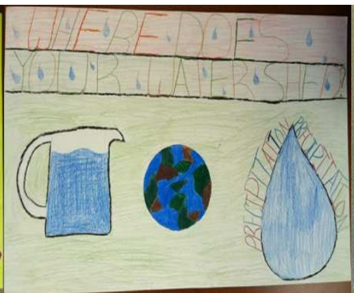
6 th Grade – 2 nd Place Caleb Brazel