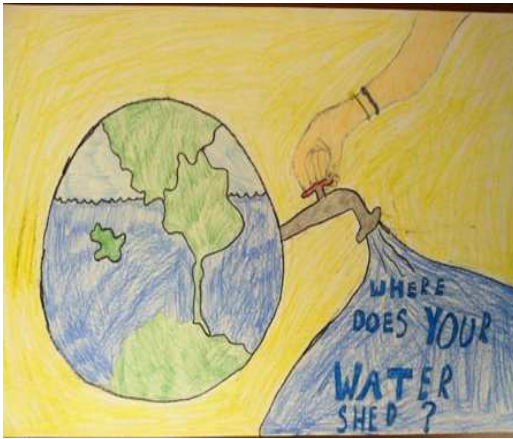
4 th Grade – 1 st Place Skylar Gott, State Qualifier