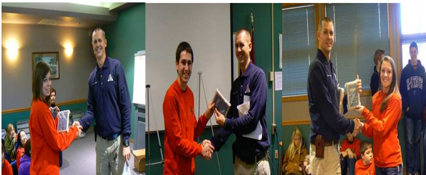
1 st Place – Norborne A

This event is possible due to the efforts and partnerships with staff of: MDC, Missouri Master Naturalists, NRCS, Soil & Water and the NW Committee. Every year this program gains momentum and without the wonderful and generous support of these individuals, this event would not be a successful and educational experience for our youth.