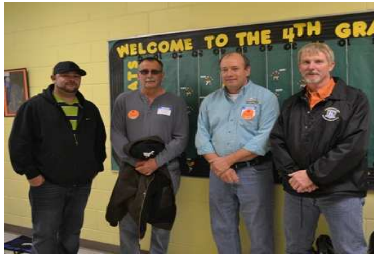
Farmland Foods Environmental Team