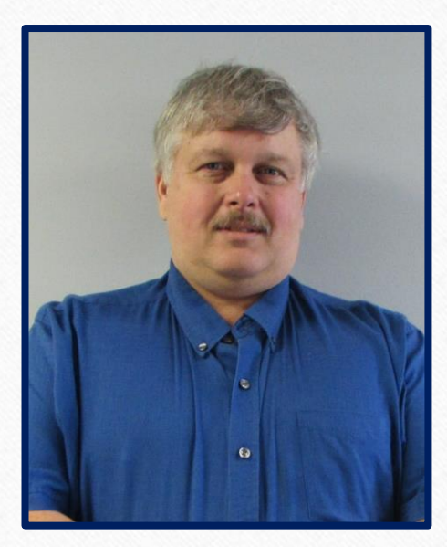
Warren Cork Area 3