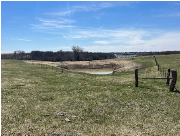
Structure built in Mozingo Watershed with Commission Cost Share Funds; Mozingo Lake in the Background