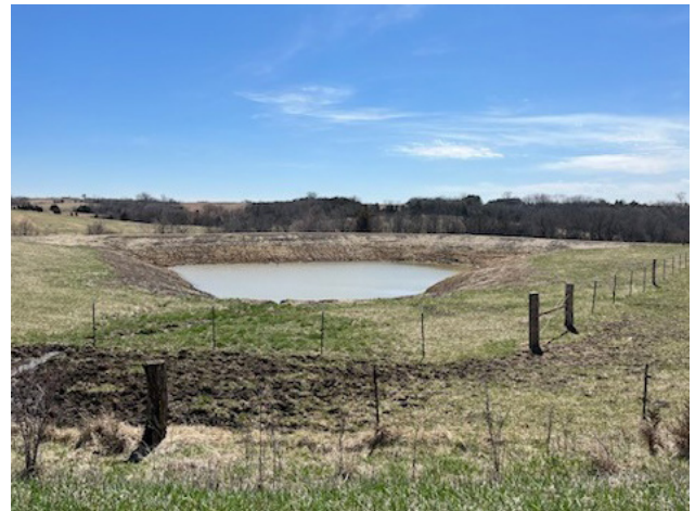
Another Structure Built in Mozingo Watershed with Commission Cost Share Funds